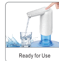
Ready for Use