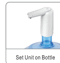
Set Unit on Bottle