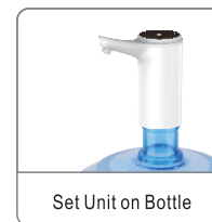
Set Unit on Bottle