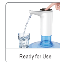
Ready for Use